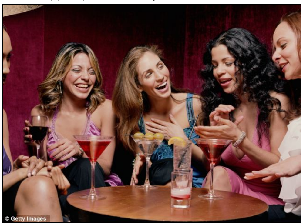
Researchers found the so-called 'language protein' that makes women more talkative also causes male rats to be more vocal than their female cage mates

Both male and female pups emitted hundreds of cries, but the males called out twice as often. As a result, when the pups were put back in the same cage as their mother, she fussed over her sons first.