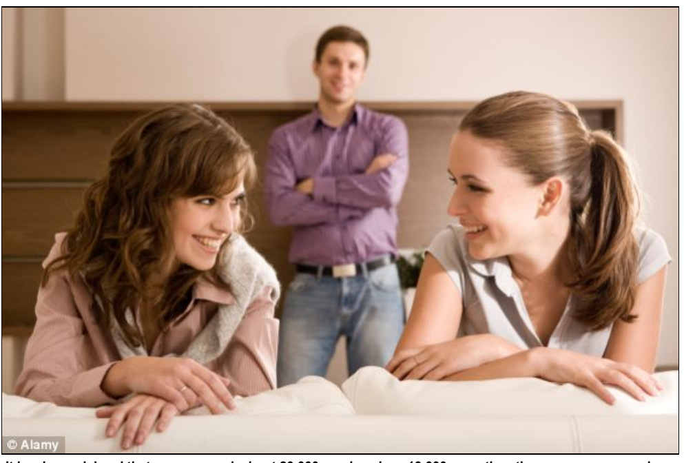
It has been claimed that women speak about 20,000 words a day - 13,000 more than the average man - and scientists say a higher amount of the Foxp2 protein is the reason women are more chatty

It has been claimed previously that women speak about 20,000 words a day - some 13,000 more than the average man.