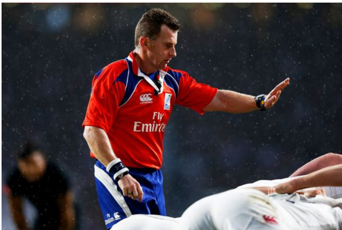
Referee Nigel Owens

And then came a point with which I would definitely disagree: “You can sense the change in attitude and maybe there is an argument to say it is becoming more like football. It is still a minority but it is there.”