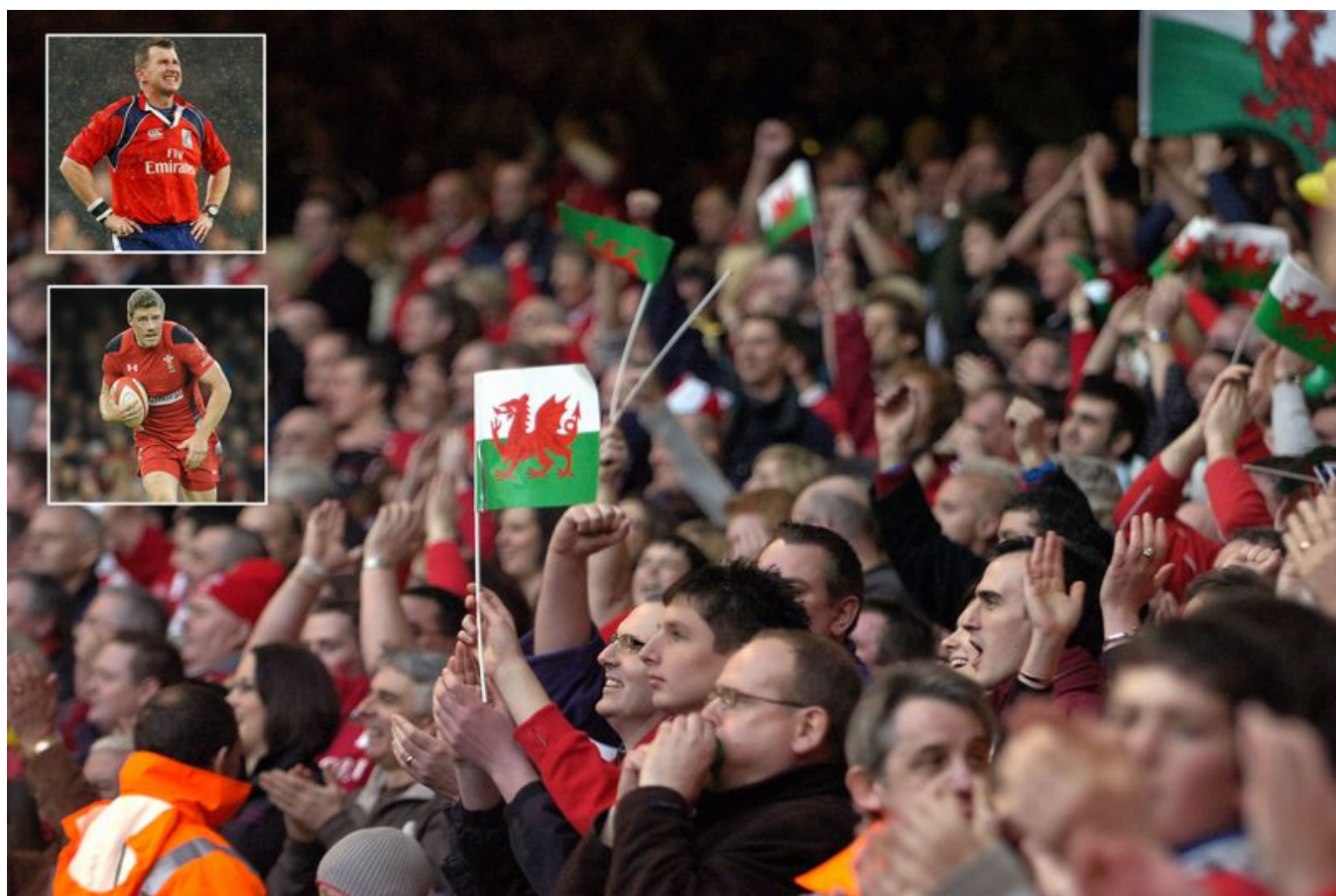
Wales rugby fans

It was always a shaky truth: that the game of rugby, that the culture of rugby, was founded on something called Respect.