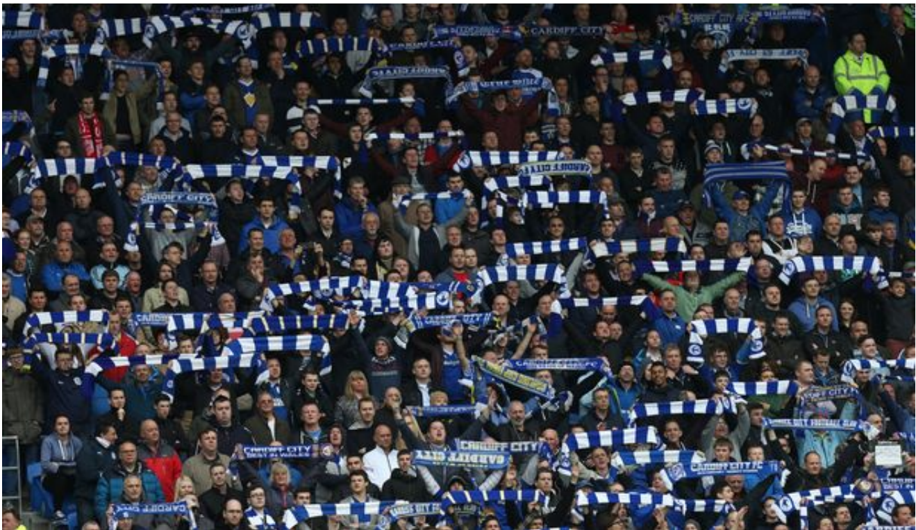
Cardiff City fans

At my football club (Cardiff City) the other day, the pre-match minute's silence for Remembrance was ruined by a small minority of Leeds United fans who chanted. They were roundly booed by Cardiff fans afterwards for their shameful behaviour.